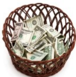
IN PERSON BY CASH OR CHECK