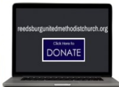
ON LINE BY EFT (ONE TIME OR ONGOING)